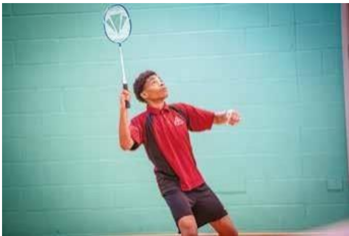
Our sports facilities allow for a wide variety of different