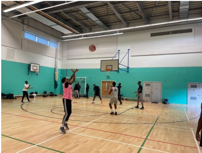
Our 6 th form Basketball Programme