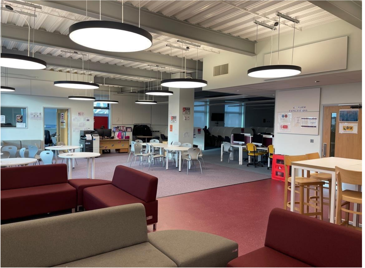
Our sixth form hub where students have the opportunity to do study in groups or independently using Macbooks.