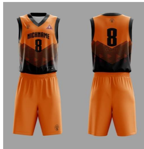
Our BTEC students have custom designed sports kit

Physiotherapist, Sports Psychologist, PE Teacher, Sports Scientist, Strength Coach.