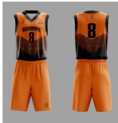
Our BTEC students have custom designed sports kit

Physiotherapist, Sports Psychologist, PE Teacher, Sports Scientist, Strength Coach.